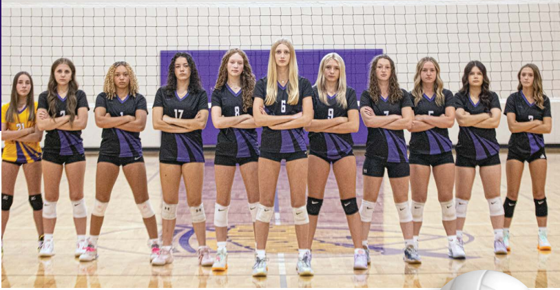
Girls Varsity Volleyball