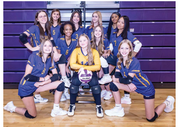
Girls JV2 Volleyball