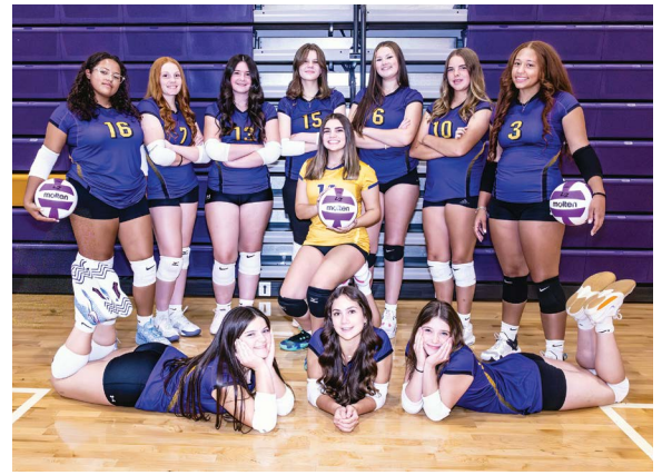
Girls JV1 Volleyball